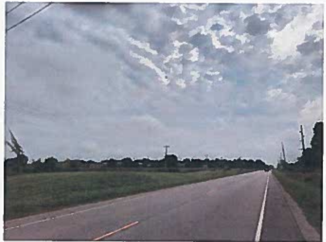
Looking east along US-40 at fields near CA Henning Elementary