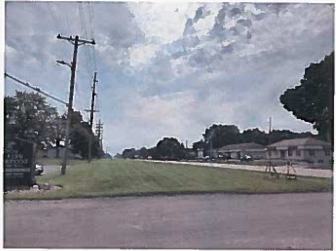
Intersection of Americana Ct. and US-40 looking east along US-40