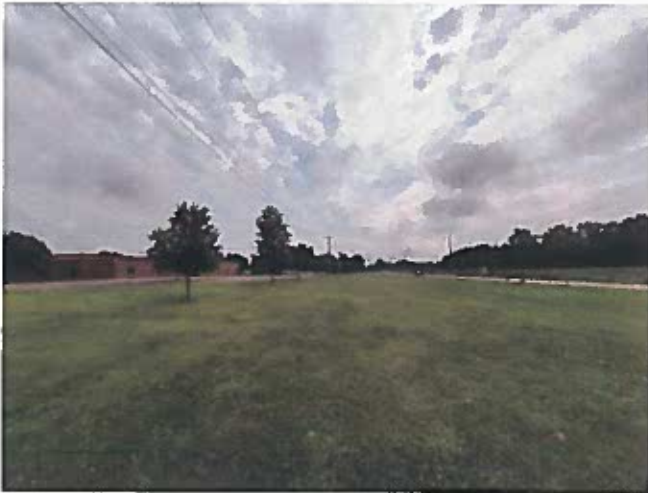
Intersection of Creekside Dr. and US-40 looking east along US-40