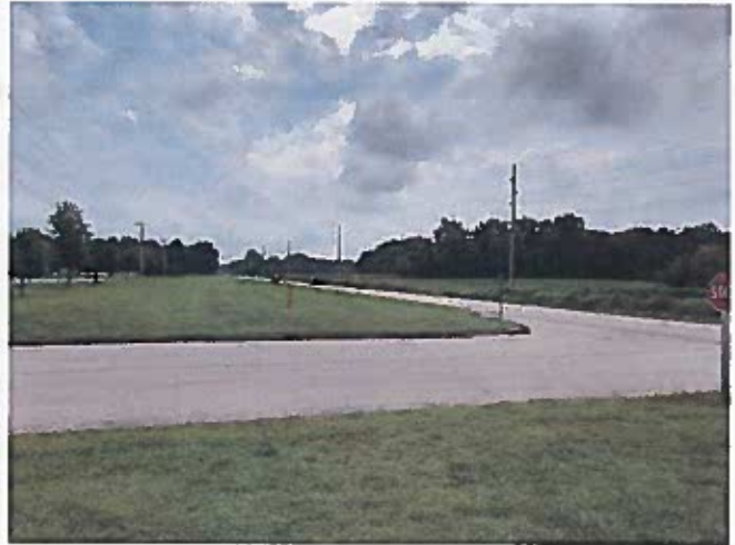
Intersection of Creekside Dr. and US-40 looking east along US-40