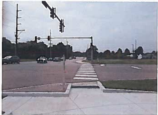
Intersection of S. Main St. and US-40 looking south along S. Main St. at existing trail running south of the intersection