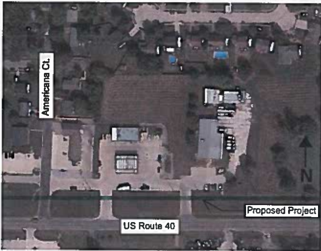
Overall Aerial Along Route