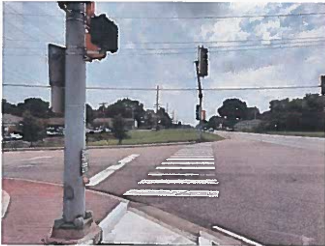
Intersection of S. Main St. and US-40 looking east along US-40 at the location of the proposed project