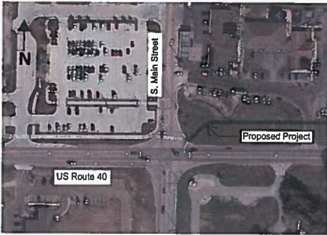
Overall Location Aerial at West Terminus