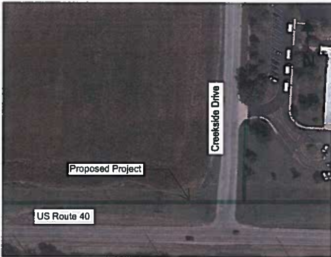
Overall Location Aerial at East Terminus