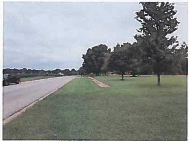
Intersection of Creekside Dr and US-40 looking north along Creekside Dr.