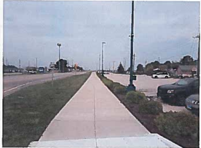
Intersection of S. Main St. and US-40 looking west along US-40 at existing MCT Trail running west of the intersection