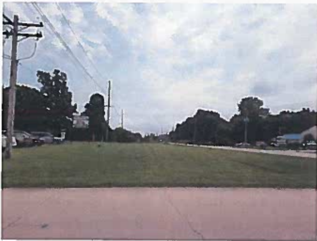
Retail center entrance looking east along US-40